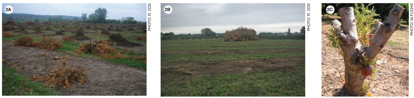
Figure 2. Full removal of peach trees that are either infected with plum pox virus or healthy but located within 50 m from an infected tree; (A) stumps were removed and (B) trees prepared for burning; (C) sucker shoots developing on a peach tree stump infected with plum pox virus provide a source of virus for aphid spread.

Produced by the New York State Integrated Pest Management Program, which is funded through Cornell University, Cornell Cooperative Extension, the NYS Department of Agriculture and Markets, the NYS Department of Environmental Conservation, and USDA-CSREES. Design by Media Services, Cornell University. Layout by Karen English, New York State IPM Program. Cornell Cooperative Extension provides equal program and employment opportunities. © 2008 Cornell University and the New York State IPM Program. Posted 9/08 at www.nysipm.cornell.edu/factsheets/treefruit/diseases/pp/pp.pdf