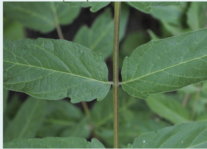
NY State IPM Program